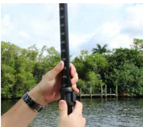
Pull adjustment lock up or down

STEP 12: Unfasten the three layers of hook and loop at the end of the leash holding the string and remove it from the leash. Tie a slipknot around the D-ring on the tail of the board next to the inflation valve. Reattach the hook and loop on the leash through the slipknot of the string. Ensure that the hook and loop is properly fastened.